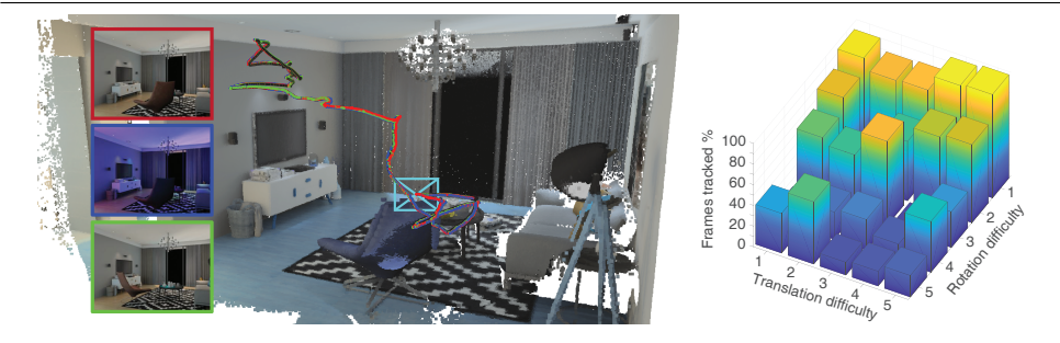
Figure 6: ( Left ) SLAM under change in lighting and object rearrangement. Estimated trajectories along with the ground truth trajectory are shown overlaid on the dense reconstruction ( Right ) Percentage of the frames tracked for 50 trajectories, running ORBSLAM2.0 .

ATE was 0.0345 m, with standard deviation of 0.02 m amongst different scenes. This indicates that the variation in the models affects the results. To further demonstrate the challenge levels in trajectories, Fig. 6 ( Right ) shows the percentage of the tracked frames by ORB-SLAM2.0 for 50 different trajectories with different difficulty levels based on maximum position and angular velocities. As the difficulty level increases, the percentage of the tracked frames drops.