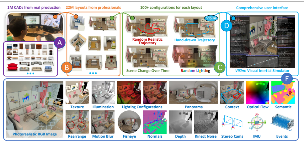
Figure 2: System Overview: an end-to-end pipeline to render an RGB-D-inertial benchmark for large scale interior scene understanding and mapping. (A) We collect around 1 million CAD furniture models from world-leading furniture manufacturers. These models have been used in the real-world production. (B) Based on those models, around 1,100 professional designers/companies create around 22 million interior layouts. Most of such layouts have been used in real-world decorations. (C) For each layout, we generate a number of configurations to represent different lightings and simulate scene change over time in daily life. (D) We provide an interactive simulator ( ViSim ) to create the ground truth monocular/stereo trajectories, as well as IMU and event camera data. Trajectories can be set manually, or using random walk and neural network based generation. (E) All supported image sequences and ground truth data.