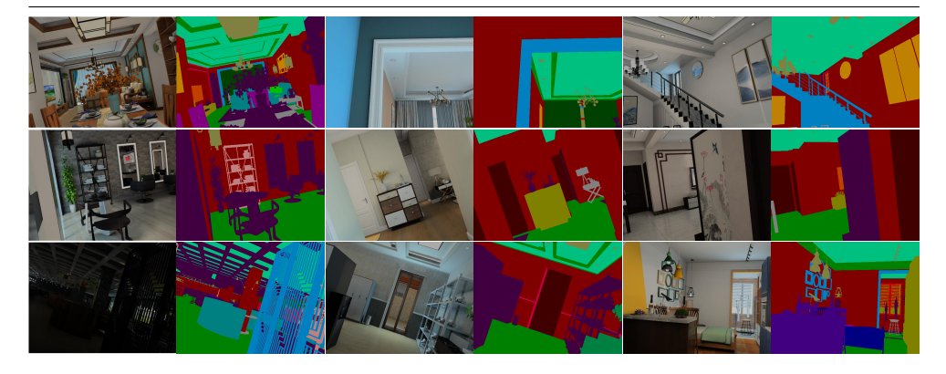
Figure 4: Our rendered images and the associated NYU40 labels.

ment. The parameters for randomly choosing lighting and rearrangement remained the same. The images of each subset mentioned above were randomly divided into 80%, 10% and 10% splits for training, validation and test sets respectively. We also release a subset of CAD models and layouts, as well as the rendering pipeline and the simulator ( ViSim ) for public.